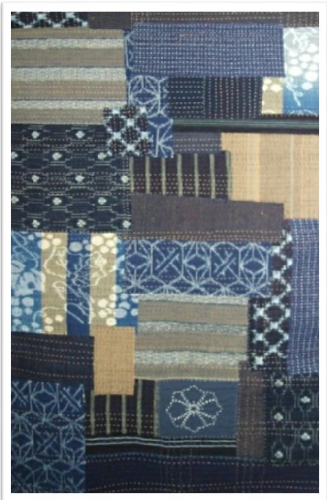
Sally Stott's Boro panel

She showed a small panel of Boro , a Japanese method of working so that no piece of fabric is ever thrown away but is carefully darned with Sashiko stitches into the thin piece of a garment to make it wearable again.