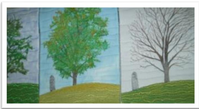
A panel of three trees at different seasons

There were lots of small journal quilts which would make ideal small projects for Mead to have a go at. They have a single theme but can be as small as 6 inches and is something everyone could have a go at. Practice makes perfect goes the old saying and I fully believe it, not everything needs to be heirloom quality but the more we practice and develop our creativity, the more we will improve in our general quilting.